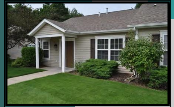
Heritage Meadows Apartments