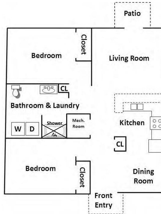
2 Bedroom ... 840 square feet