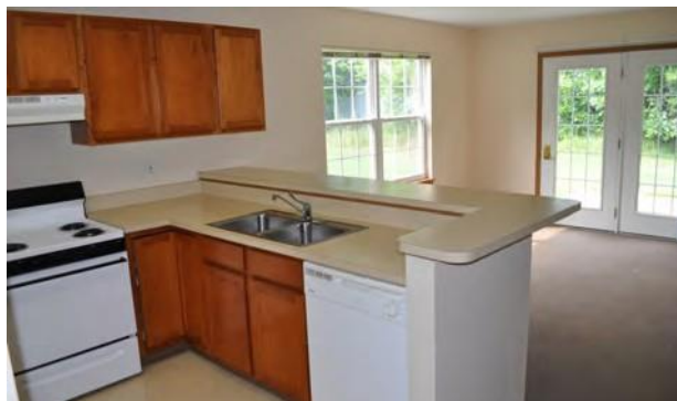
Spacious duplexes with open concept floor plan