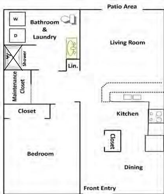
1 Bedroom ... 715 square feet